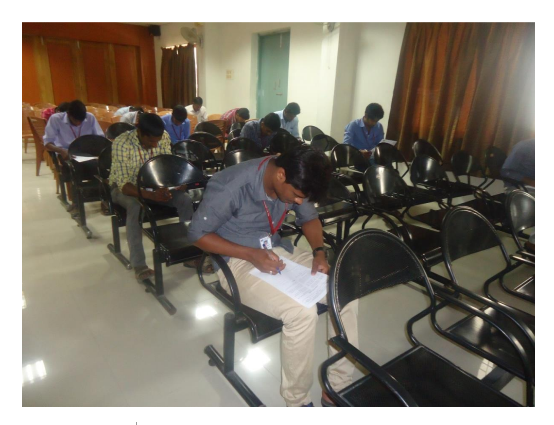
Intra college puzzle contest 2016 - Round III