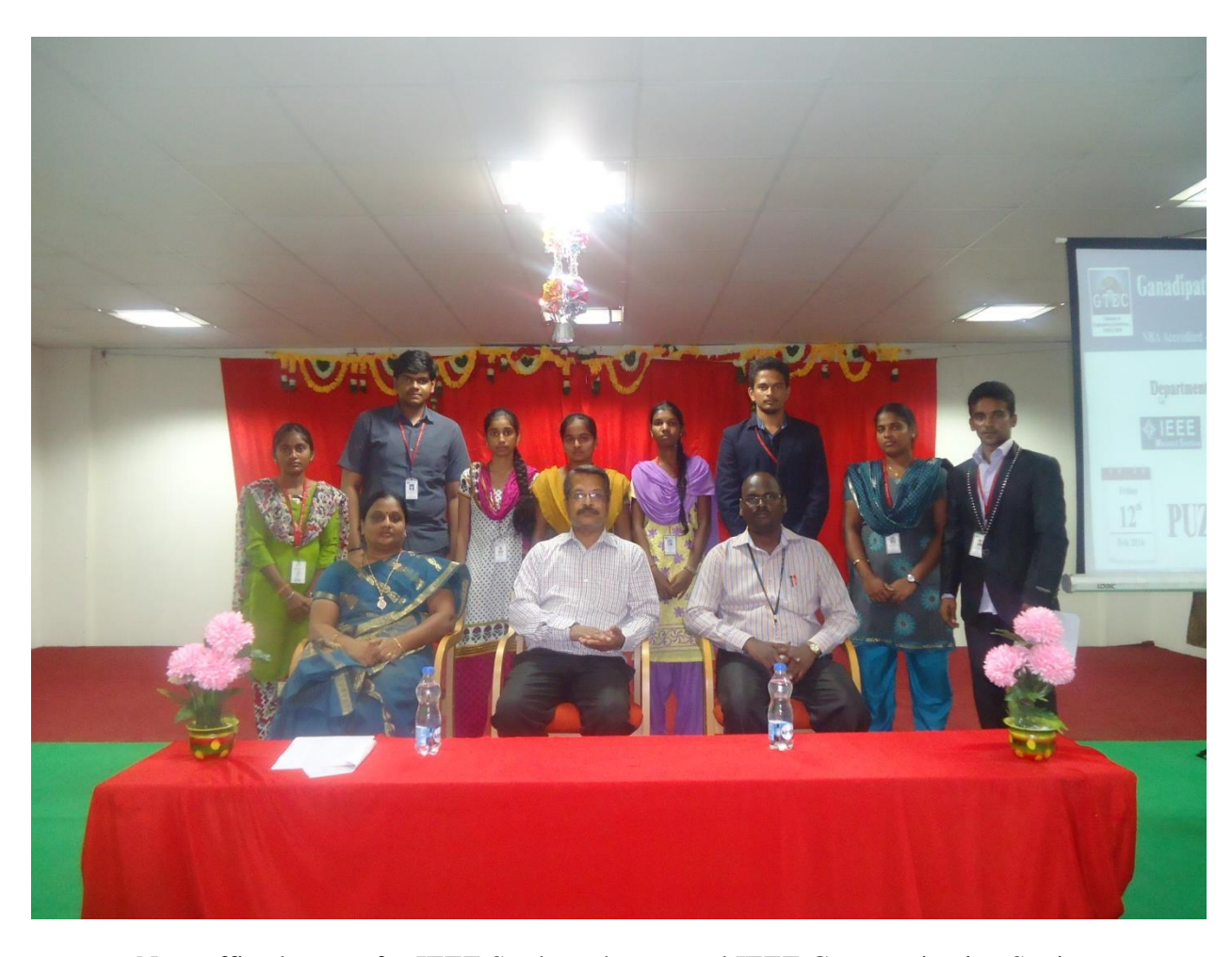
New office bearers for IEEE Student chapter and IEEE Communication Society