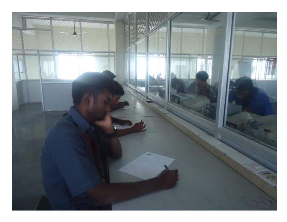
Intra college puzzle contest 2016 - Round II